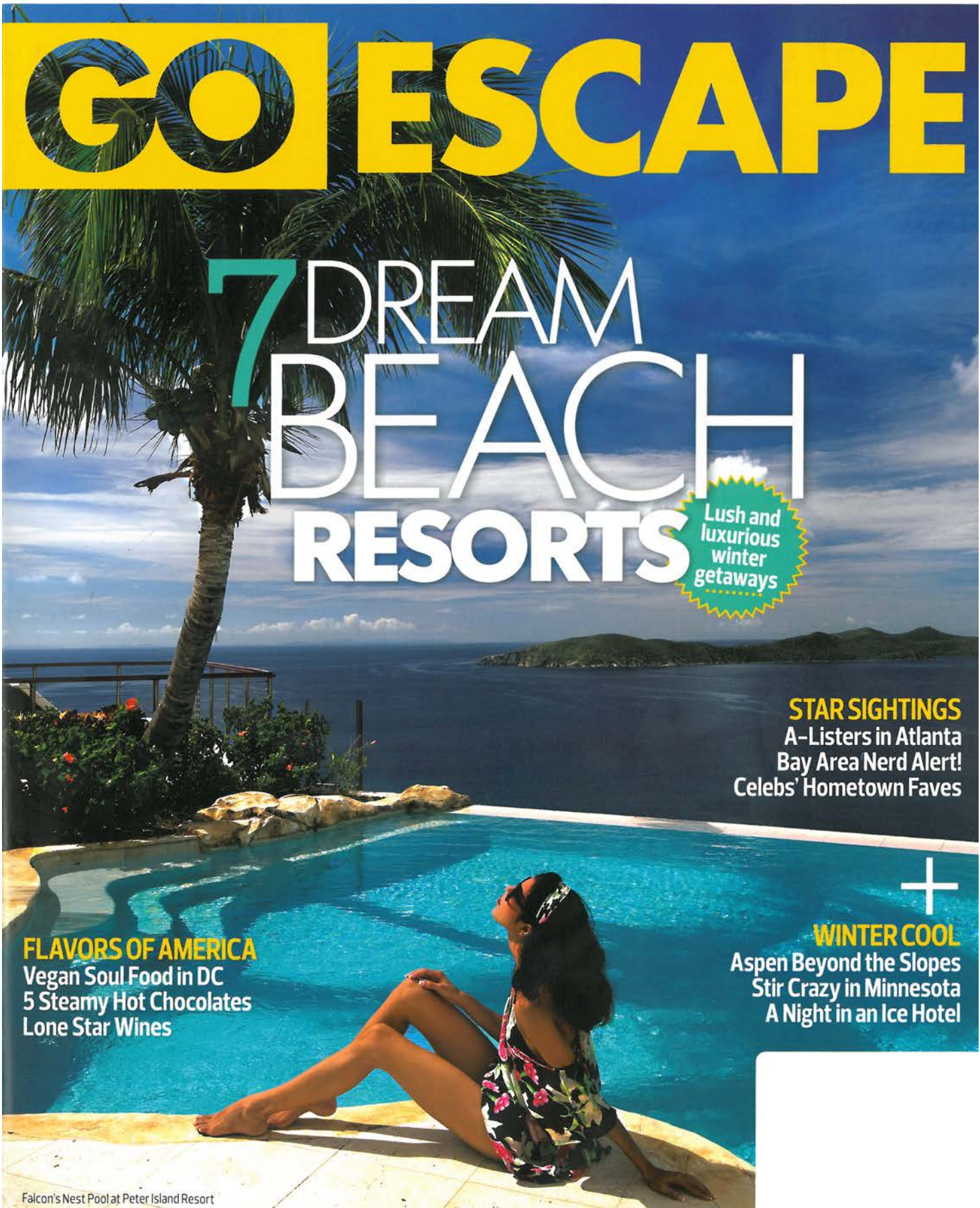
Falcon's Nest Pool at Peter Island Resort

FLAVORS OF AMERICA Vegan Soul Food in DC 5 Steamy Hot Chocolates Lone Star Wines