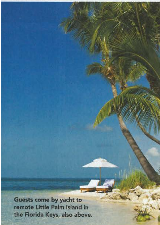
Guests come by yacht to remote Little Palm Island in the Florida Keys, also above.