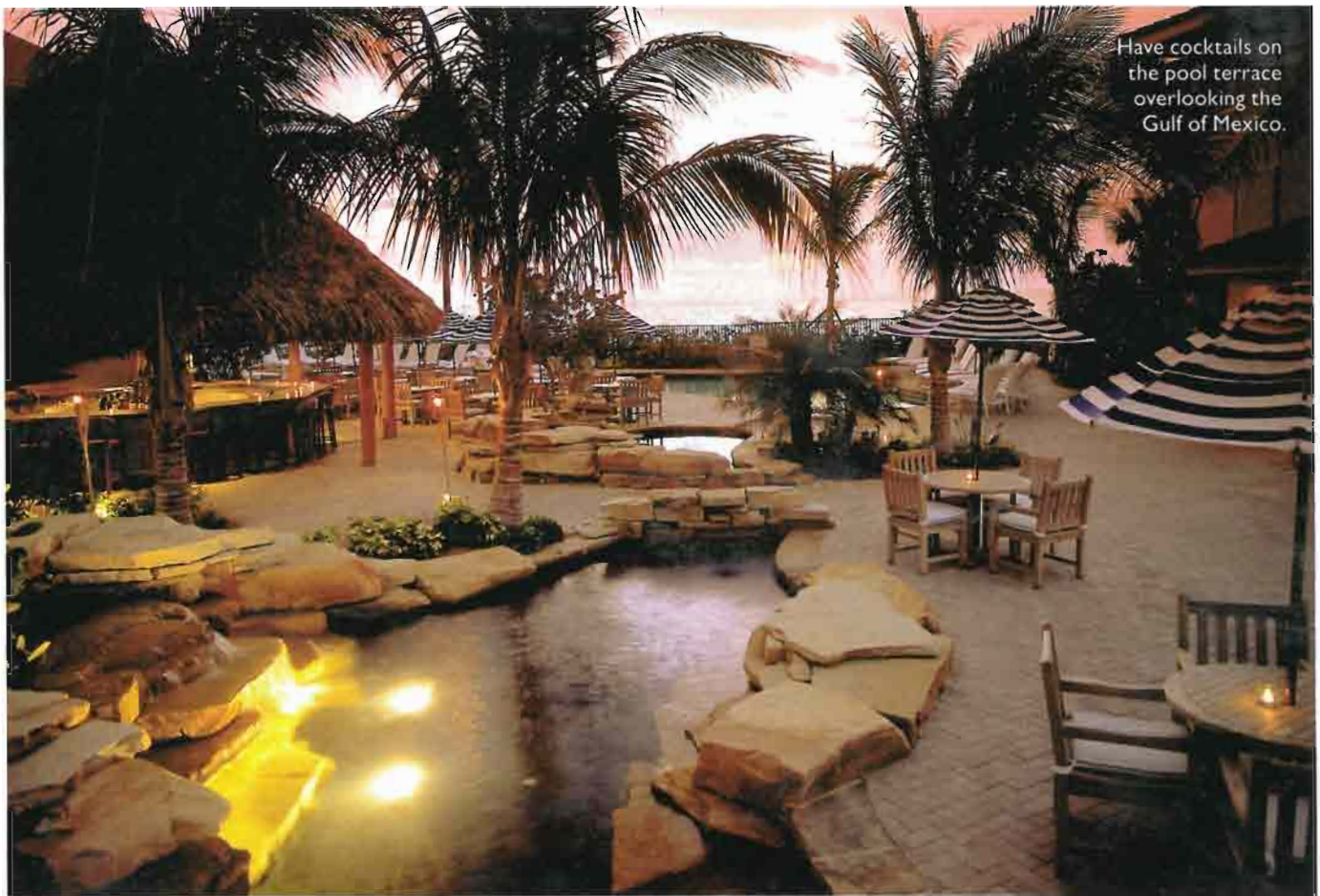
Have cocktails on the pool terrace overlooking the Gulf of Mexico.